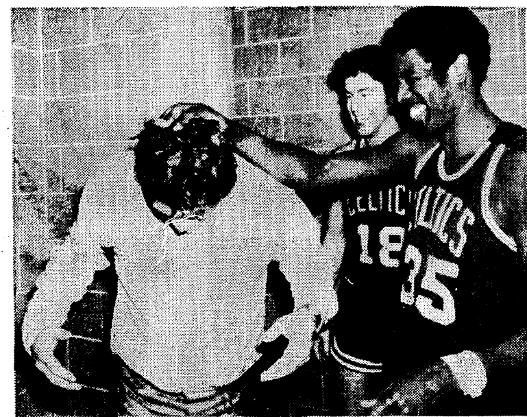
Celtics coach Tommy Heinsohn got an unexpected shower from Dave Cowens (18) and Paul Silas (35) after Boston won the NBA crown Sunday.